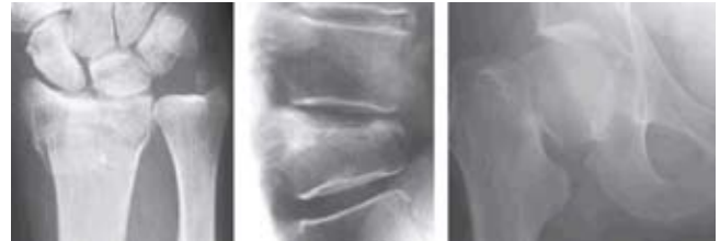
Figure 2: The wrist, spine and hip (left to right) are typical sites of osteoporotic fracture

The aims of the clinical history, physical examination and clinical tests are to exclude diseases that mimic osteoporosis (for example, osteomalacia, myeloma), identify secondary causes of osteoporosis and contributory factors, assess the risk of subsequent fractures and select the most appropriate form of treatment. Relevant tests are shown in box 2.